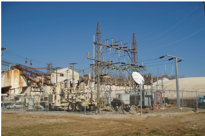
Hughes satellite broadband at a power substation