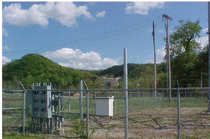
Hughes satellite broadband at a transmission line